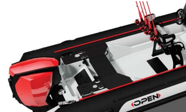
Aft seating is 100% removable.

New to the Pro Open line, the Open 7 joins the Pro Open 550 & 650 - a design that has truly moved beyond the boundaries in the RIB world for 20 years .