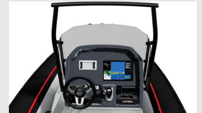
A perfectly ergonomic driving cockpit.

With its V-hull and optimized deck plan for better mobility onboard, the Open offers exceptional stability for cruising. It is the perfect balance between performance and comfort. You can enjoy any day at sea with family and friends.