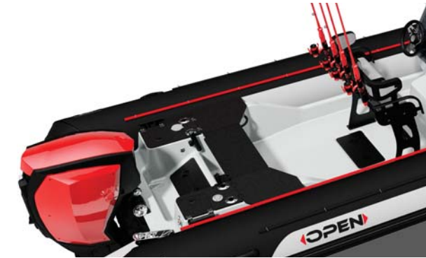
Aft seating is 100% removable.

New to the Pro Open line, the Open 7 joins the Pro Open 550 & 650 - a design that has truly moved beyond the boundaries in the RIB world for 20 years .